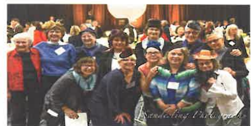
Members of the "Writing for the Moment" class don smart chapeaus and stylish pillboxes